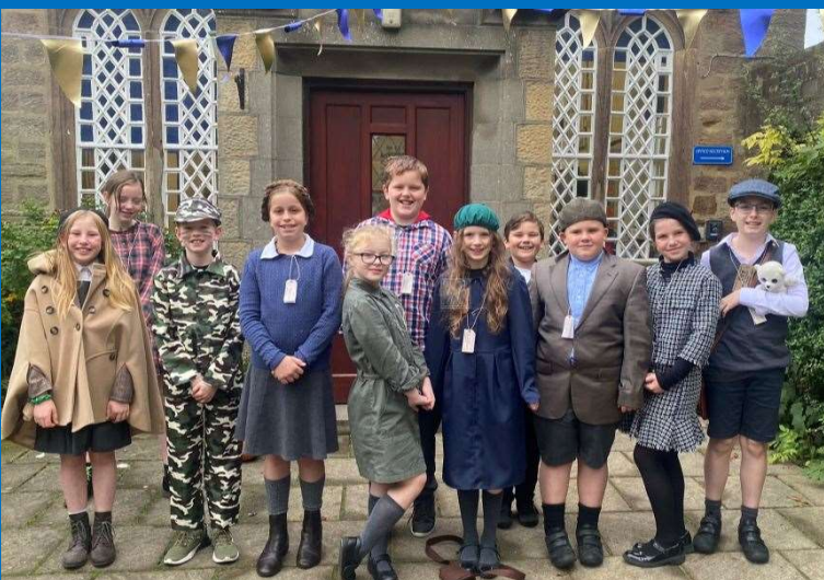
WW2 Day - Class 3