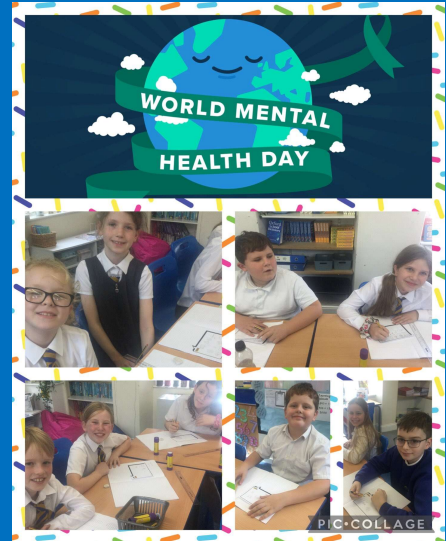
World Mental Health Day