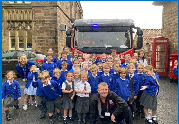
North Yorkshire Fire Safety Talk