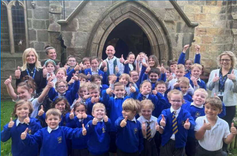
SIAMS - Congratulation Team Ripley!